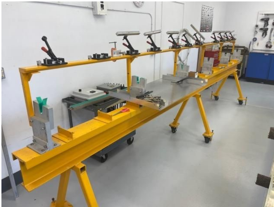
Blade Bonding Fixture