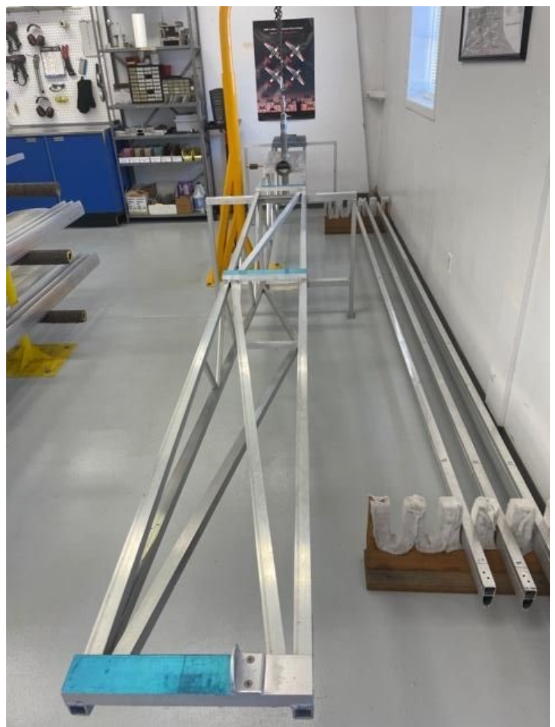
Blade Balance Fixture